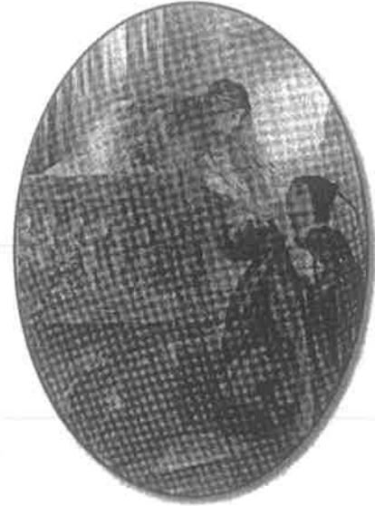
The story of Romeo and Juliet's ill-fated love has captivated audiences for centuries.