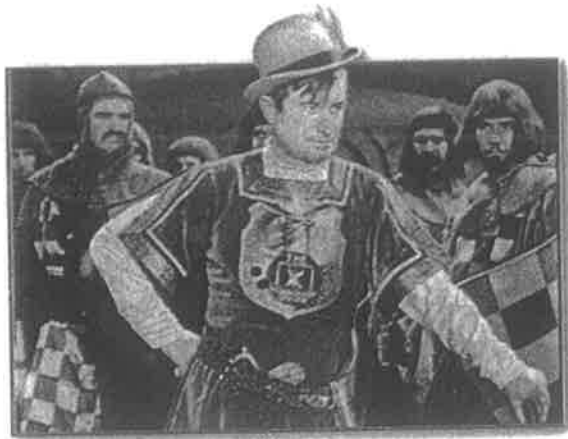
Mark Twain was one of the greatest humor writers in American literature. In A Connecticut Yankee , his main character goes back in time to the era of knights in armor.